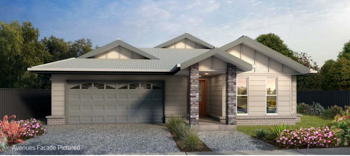
Avenues Facade Pictured