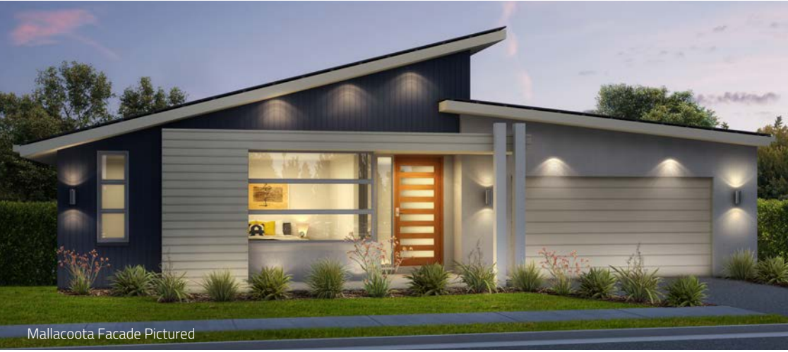
Mallacoota Facade Pictured