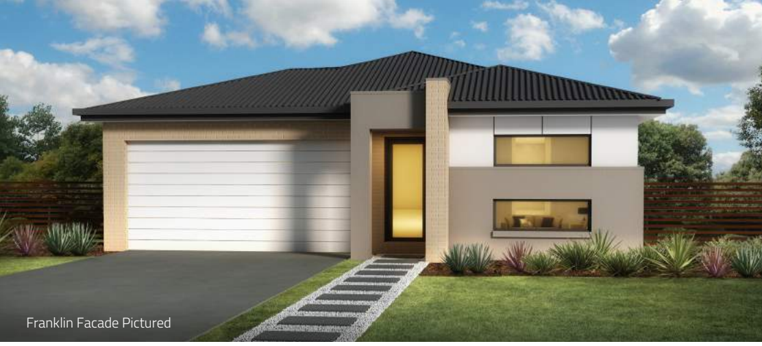
Franklin Facade Pictured